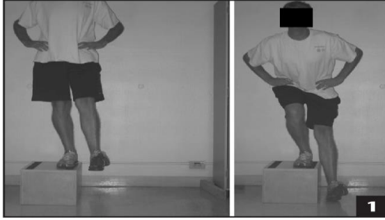
Figure 2. Image of the Lateral Step-Down Test